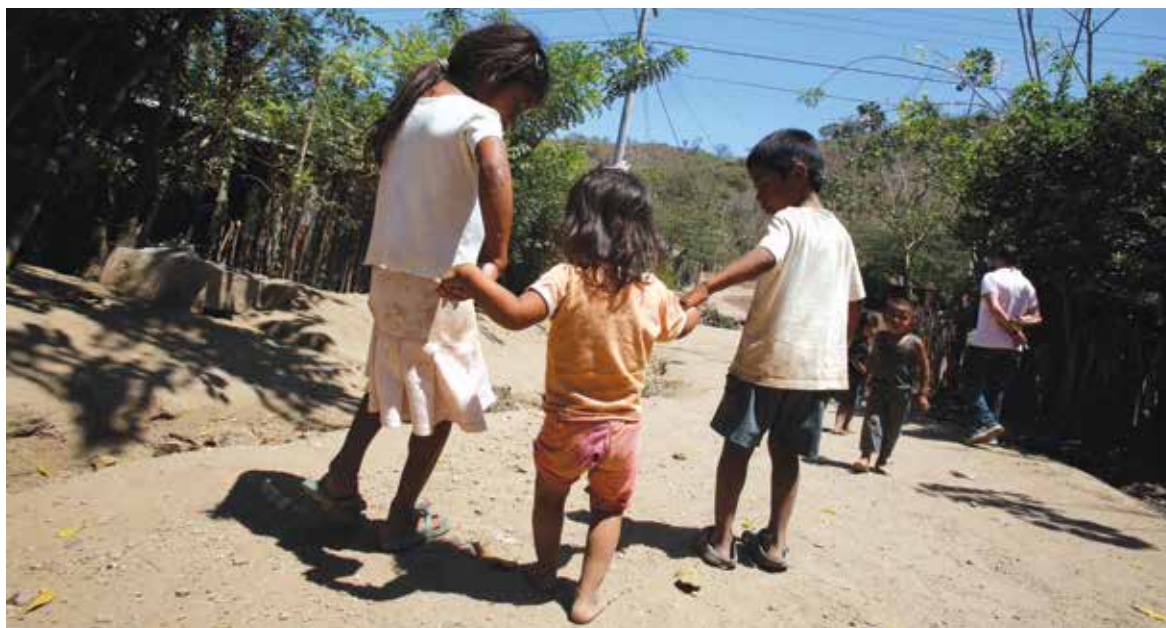
Children walk through Los Limones, a village near Zacapa, where residents lack safe, sturdy homes.