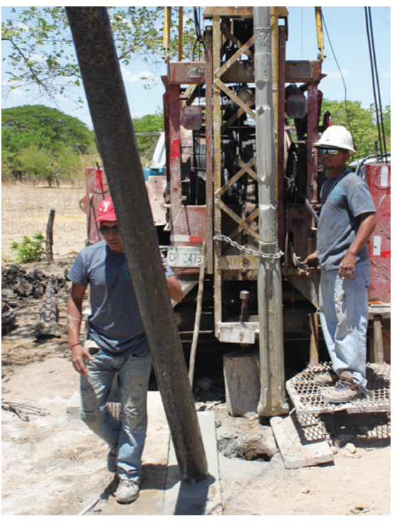
A well-drilling rig such as this one will be used to tap into a water source 420 feet below ground.

Rainbow Network — an interdenominational Christian ministry based in Nicaragua.